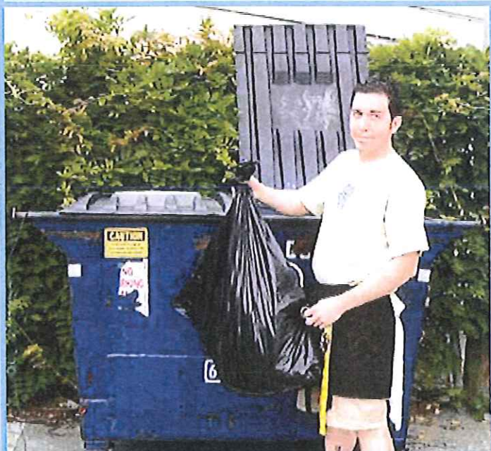
Proper disposal of trash, and covered dumpsters are keys to healthy waterways.

Following the laws of gravity, water flows downhill to collect in the lowest spot. This creates flow paths that can pick up loose soil (erosion) and any pollutants left on the ground.