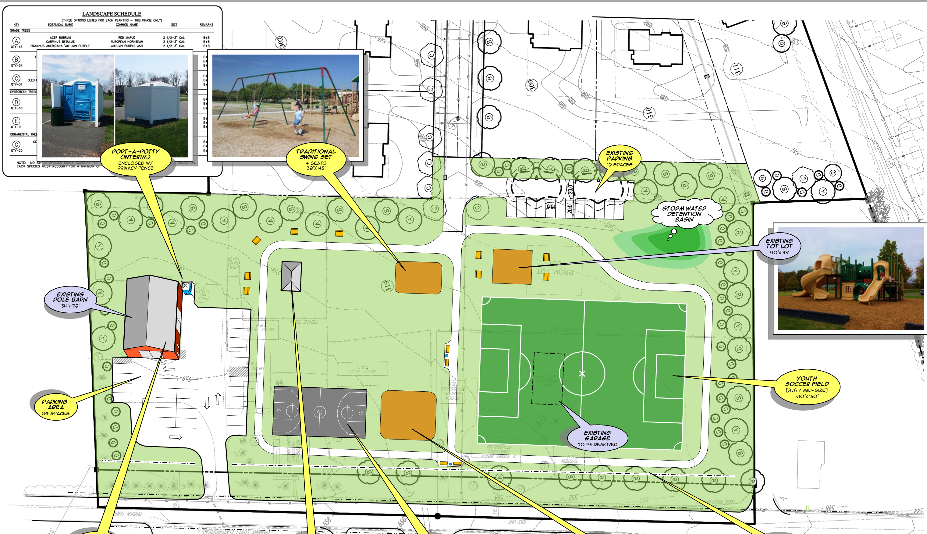
PORT-A-POTTY (INTERIM) ENCLOSED W/ PRIVACY FENCE

NOTE: NO SHADE SPECIES SHALL ACCOUNT FOR MORE THAN 10% OF EACH SPECIES MUST ACCOUNT FOR A MINIMUM OF 10% OF TOTAL PLANTING