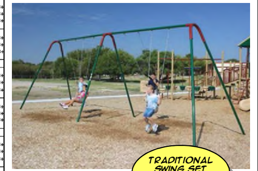
TRADITIONAL SWING SET 4 SEATS 33' X 45'